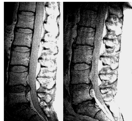
Product Packager / Taxi Driver (49 yrs old)