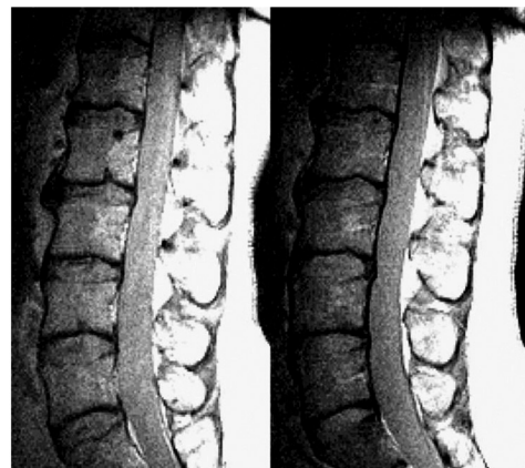
Typesetter / Farmer (50 yrs old)