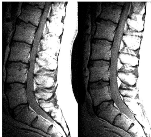
Office Worker / Truck Driver (56 yrs old)