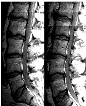
Farmer / Driver (61 yrs old)