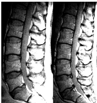
Both Sales Managers (64 yrs old)