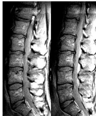
Programmer / Plumber (48 yrs old)