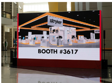
Premium Spotlight Package